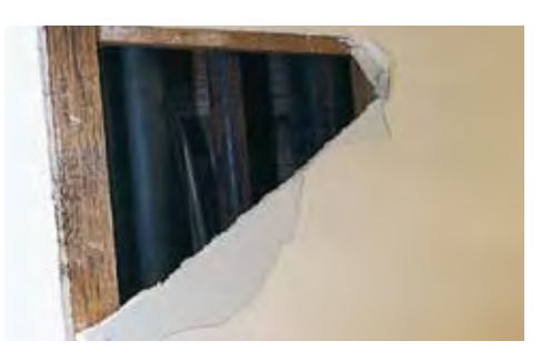
Asbestos insulating board (AIB)