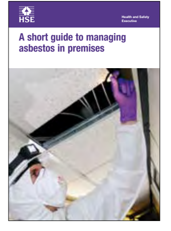
This is a web-friendly version of leaflet INDG223(rev4), revised 11/09