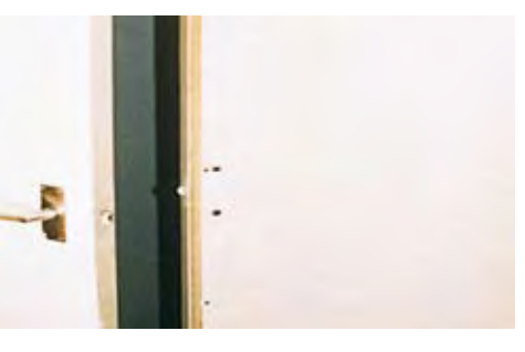
Door with AIB panel